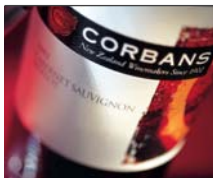
CORBANS CABERNET SAUVIGNON MERLOT

Cabernet Sauvignon is to the red-wine world what Chardonnay is to the white: wine of impeccable pedigree and huge popularity. In New Zealand, Cabernet Sauvignon has generally performed best in the warmth of Hawke's Bay, where in favourable vintages the great Bordeaux variety yields fragrant, sturdy wine with complexity and longevity. Blackcurrant and herb characters, new oak and a backbone of firm tannin are all hallmarks of fine young Cabernet Sauvignon, whose drink-young appeal is often enhanced by blending with Merlot. With bottle age, Cabernet-based reds develop impressive complexity and roundness.