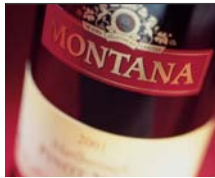
MONTANA MARLBOROUGH PINOT NOIR

With an array of notably perfumed, richly flavoured and supple wines, Pinot Noir has staked its claim to be New Zealand's star red wine of the future. The great red-wine grape of Burgundy thrives in cool-climate regions, including Martinborough, Marlborough and Central Otago. By far our most widely planted red variety, Pinot Noir is typically full but not dense in colour; in its youth tasting of cherries, raspberries and strawberries. Mature Pinot Noir can be highly complex, with a beguiling array of aromas and flavours suggestive of red berry fruits, violets, coffee and mushrooms.