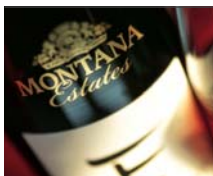
FAIRHALL ESTATE MARLBOROUGH CABERNET SAUVIGNON