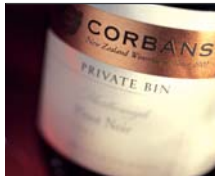
CORBANS PRIVATE BIN MARLBOROUGH PINOT NOIR