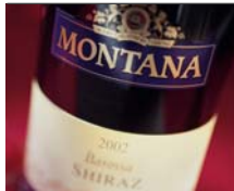
MONTANA BAROSSA SHIRAZ

Shiraz typically yields robust, richly flavoured reds with a heady perfume. In Australia, where it is the most extensively planted red-wine variety, top versions are almost opaque, with a characteristic spicy, black pepper aroma and flavour. The powerful, concentrated Shirazes of the Barossa Valley and McLaren Vale are recognised as among Australia's greatest gifts to the wine world. Grenache—like Shiraz a traditional grape variety of the Rhône Valley, where the two are often blended—also yields some exciting wines in Australia, especially from old, unirrigated, bush-pruned vines.