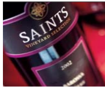
SAINTS BAROSSA SHIRAZ