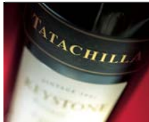
TATACHILLA KEYSTONE McLAREN VALE GRENACHE SHIRAZ