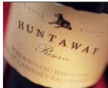
HUNTAWAY RESERVE MARLBOROUGH HAWKE'S BAY MERLOT CABERNET SAUVIGNON