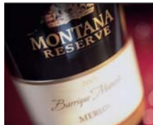
MONTANA RESERVE MARLBOROUGH MERLOT