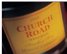
CHURCH ROAD RESERVE HAWKE'S BAY MERLOT CABERNET