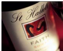
ST HALLETT FAITH BAROSSA SHIRAZ