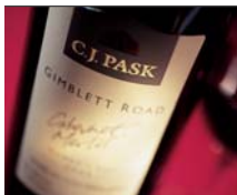
C.J. PASK GIMBLETT ROAD CABERNET MERLOT