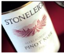
STONELEIGH MARLBOROUGH PINOT NOIR