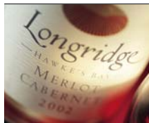
LONGRIDGE HAWKE'S BAY MERLOT CABERNET

Merlot produces red wines of alluring richness, plumpness and suppleness. With its early ripening nature—two to three weeks ahead of Cabernet Sauvignon—Merlot grapes achieve higher sugar levels, lower acidity and riper fruit flavours. Until a few years ago, Merlot's key role was that of a minority blending variety, bringing a floral, plummy fruitiness and soft, mouth-filling richness to its marriages with the firmer Cabernet Sauvignon. Now, with the fast-rising stream of straight Merlots and Merlot-dominant blends, this classic Bordeaux variety has been recognised as a top-flight wine in its own right.