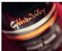
GIBBSTON VALLEY CENTRAL OTAGO PINOT NOIR