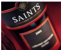
SAINTS CABERNET SAUVIGNON MERLOT