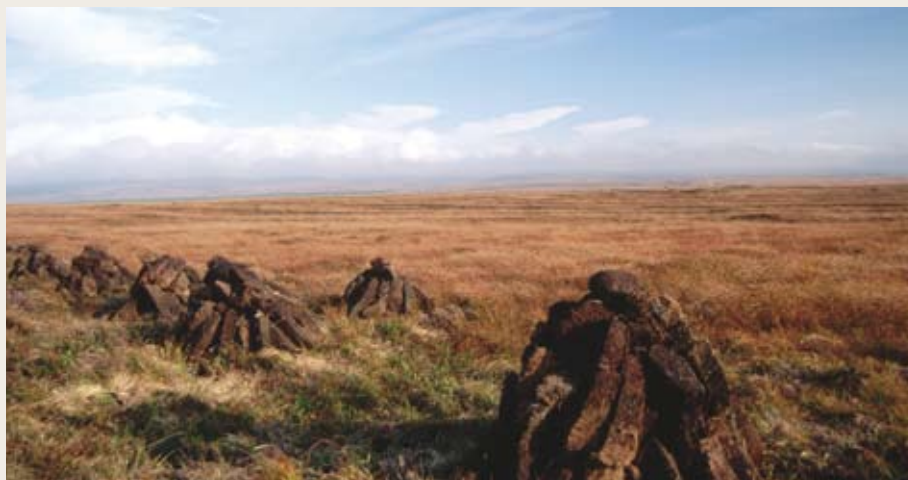
Each peat bog on Islay adds a unique flavour signature to the final whisky

He found not only that peat from different