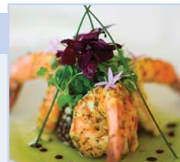
OCEAN GARDEN PRODUCTS

Additionally, color plays an important visual role as an anticipator of what we are about to eat. Dull green produce looks as if it lacks freshness while bright red tomatoes appear ripe and juicy. Pale chicken looks bland while a golden crust looks crunchy and delicious. Diners are easily turned on or off by color before they have a single taste.