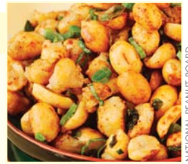
NATIONAL PEANUT BOARD

Even though texture does not have a flavor, texture gives us cues to what we should taste. For instance, if ice cream is crunchy, we know that it was frozen to an undesirable temperature. Pasta with a slight give against our teeth is cooked al dente. Mushy fruit indicates that it's past its prime.